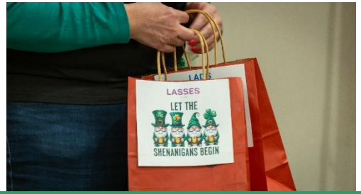
A generous leprechaun provided surprise gifts for one lucky lass (Kris Droster) and one lucky lad (Jim Wasilewski)

And then ... a hard working photographer leprechaun created a collage of shenanigans